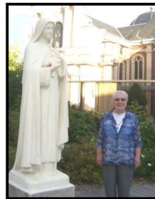
Sr. Therese in Lisieux September 18 ~ her birthday!